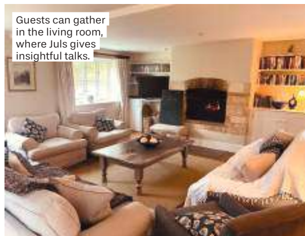
Guests can gather in the living room, where Juls gives insightful talks.