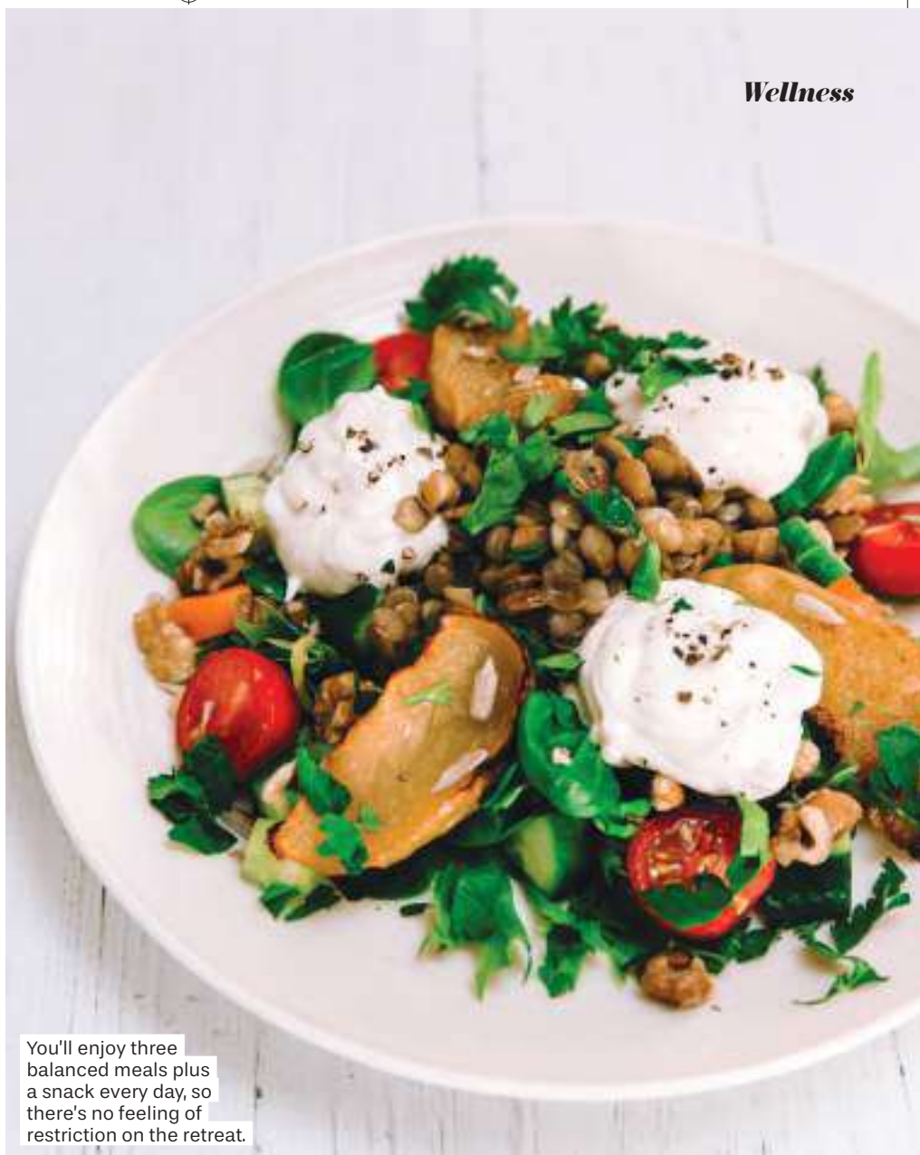
You'll enjoy three balanced meals plus a snack every day, so there's no feeling of restriction on the retreat.

During the week, we attended insightful talks on food and nutrition where Juls debunked diet myths, cleared up confusion around weight management and explained her 80/20 rule. Juls encourages women to follow healthy food rules 80 per cent of the time with 20 per cent leeway, because she recognises that we aren't robots