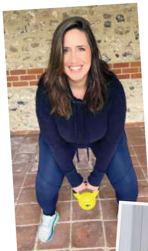
The workouts were intense but short – perfect for me!

Daily guided country walks are a highlight for many on the retreat.