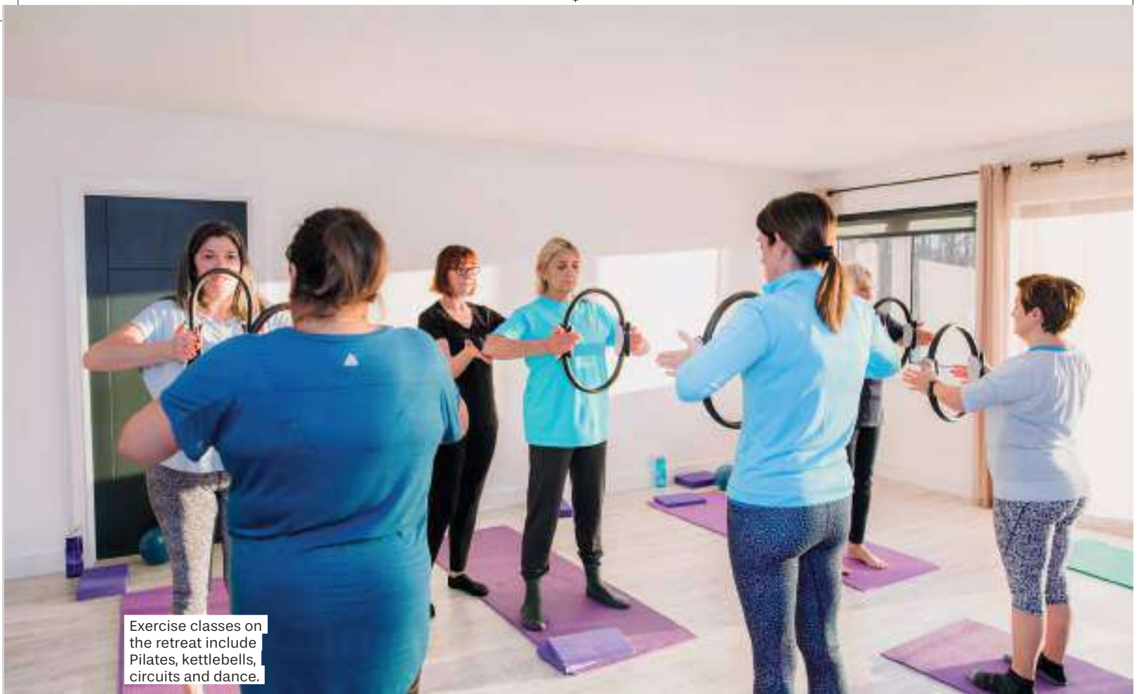
Exercise classes on the retreat include Pilates, kettlebells, circuits and dance.

and can't be perfect all the time when it comes to food choices.